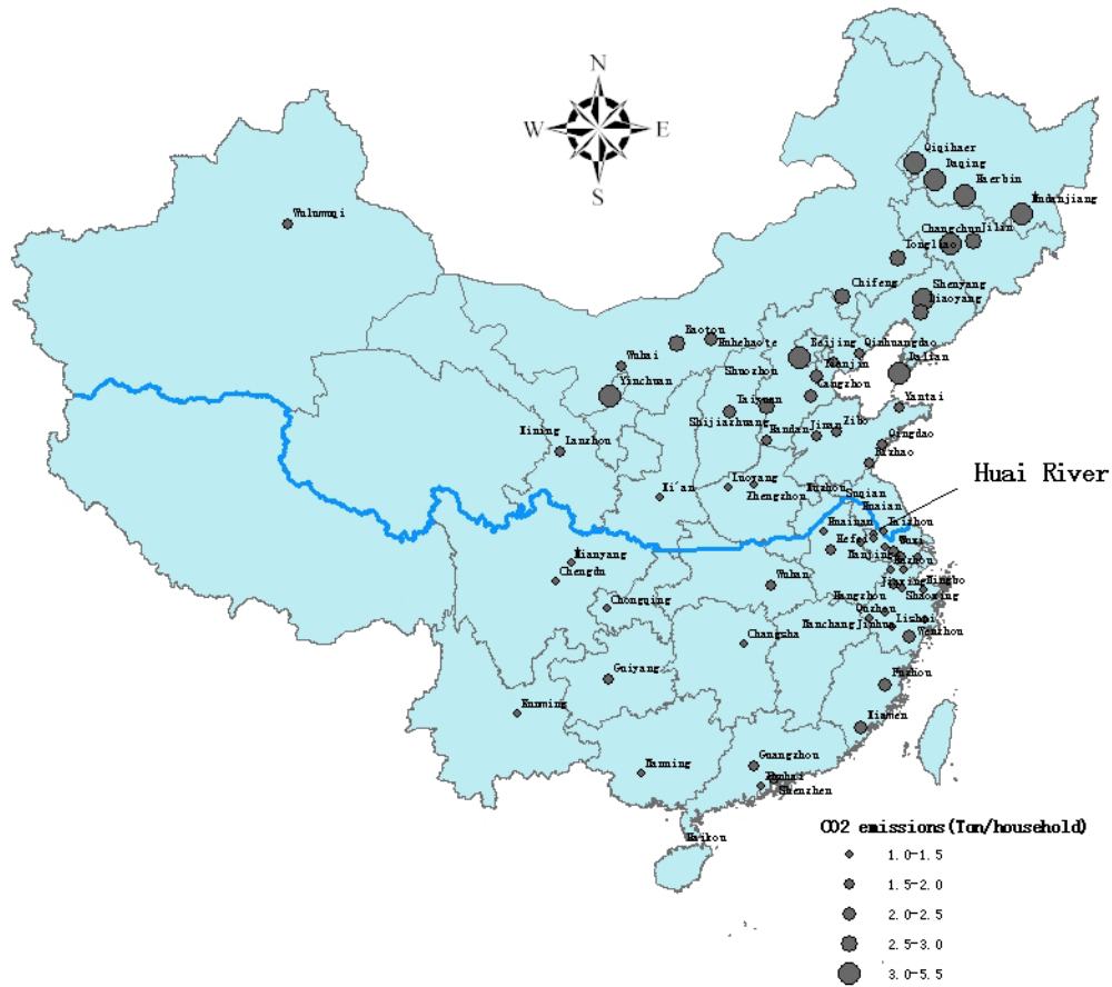
Figure 1: Carbon Dioxide Emissions per Household in 74 Chinese Cities